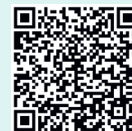
Humly Room Display

Humly Room Display is the perfect interactive display for your collaboration spaces. It will help you to find the space you already booked, or guide you to one that is available right now.