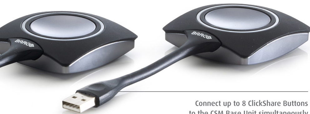
Connect up to 8 ClickShare Buttons to the CSM Base Unit simultaneously