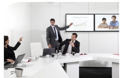
Dual screen support