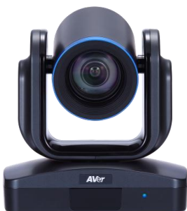
eCam PTZ II