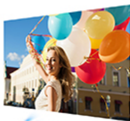
SuperColor™ projectors offer color accuracy levels