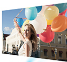
Conventional projectors offer low-quality images