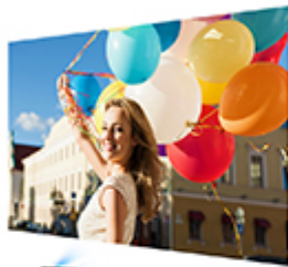
SuperColor™ projectors offer color accuracy levels