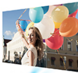
Conventional projectors offer low-quality images