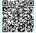
Humly Room Display

Humly Room Display is the perfect interactive display for your collaboration spaces. WiFi, Bluetooth and USB disabled from factory assures next level security. It will help you to find the space you already booked, or guide you to one that is available right now.